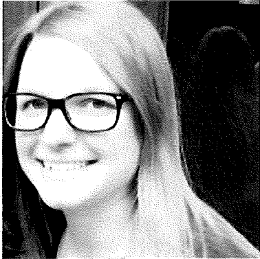
Exhibit 1: LinkedIn Page for Alyse Maye Quade